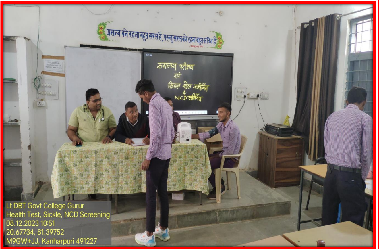
Lt DBT Govt College Gurur Health Test, Sickle, NCD Screening 08.12.2023 10:51 20.67734, 81.39752 M9GW+JJ, Kanharपुरी 491227