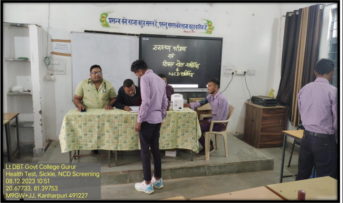
Lt DBT Govt College Gurur Health Test, Sickle, NCD Screening 08.12.2023 10:51 20.67733, 81.39753 M9GW+JJ, Kanharपुरी 491227