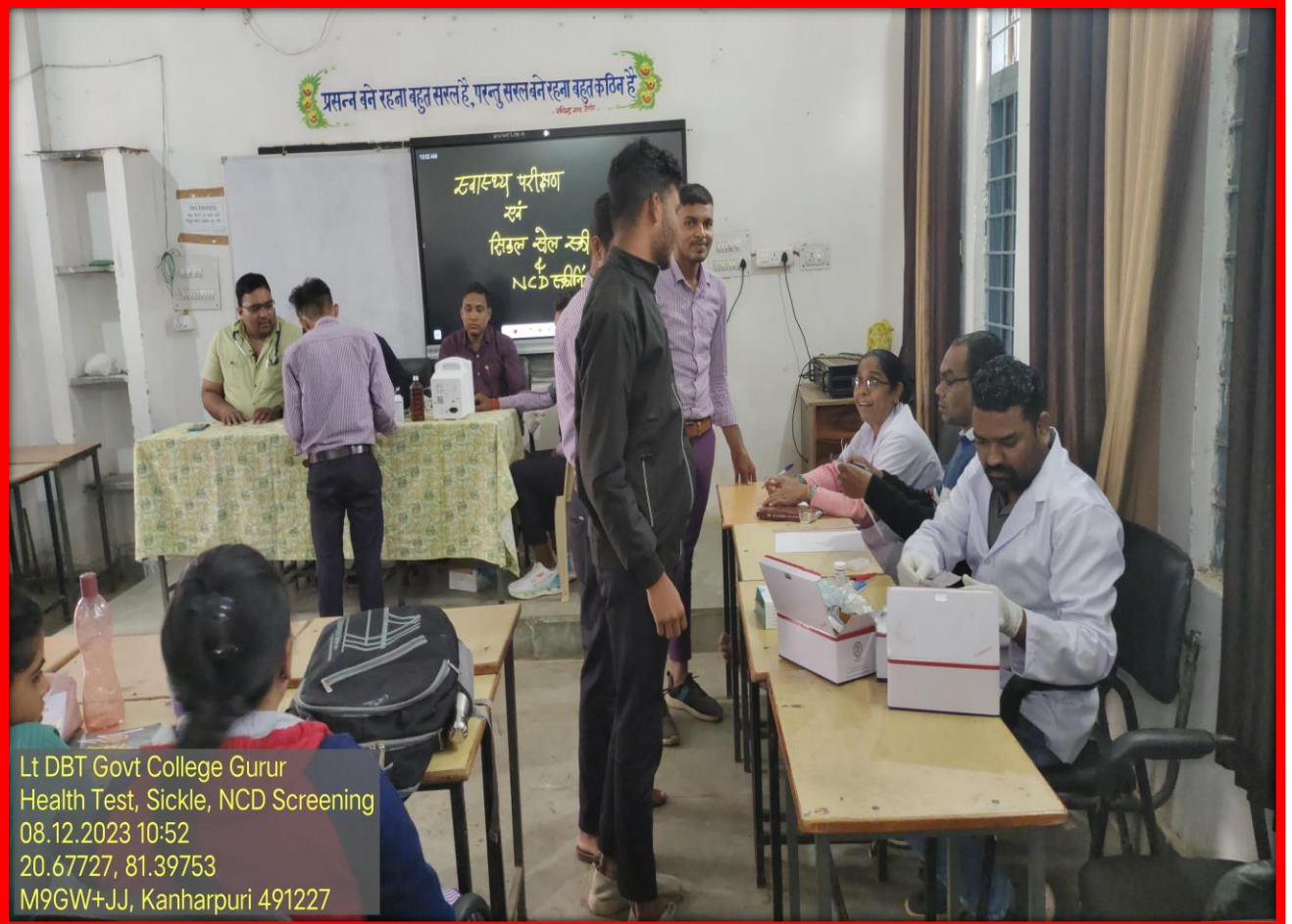
Lt DBT Govt College Gurur Health Test, Sickle, NCD Screening 08.12.2023 10:52 20.67727, 81.39753 M9GW+JJ, Kanharpuri 491227